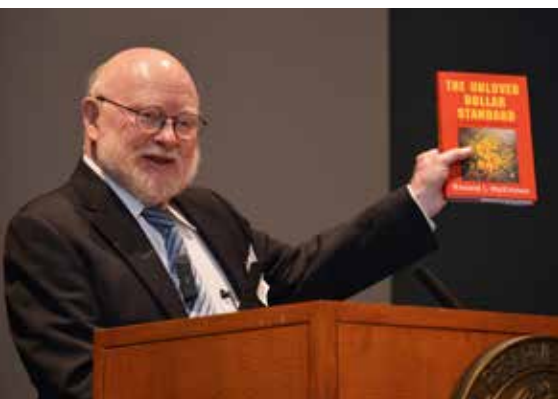
Professor Ronald McKinnon of Stanford University

Many of the issues that McKinnon raised in his opening remarks are addressed at greater length in his book, The Unloved Dollar Standard: From Bretton Woods to the Rise of China . Following his presentation, audience members questioned some elements of his thesis, such as how low interest rates might simultaneously boost commodity prices and not stimulate demand in advanced economies, or how a policy of low short-term interest rates detracted from the ability of banks to lend profitably.