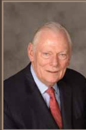
Herbert D. Kelleher (Deputy Chairman) Founder and Chairman Emeritus, Southwest Airlines Co.